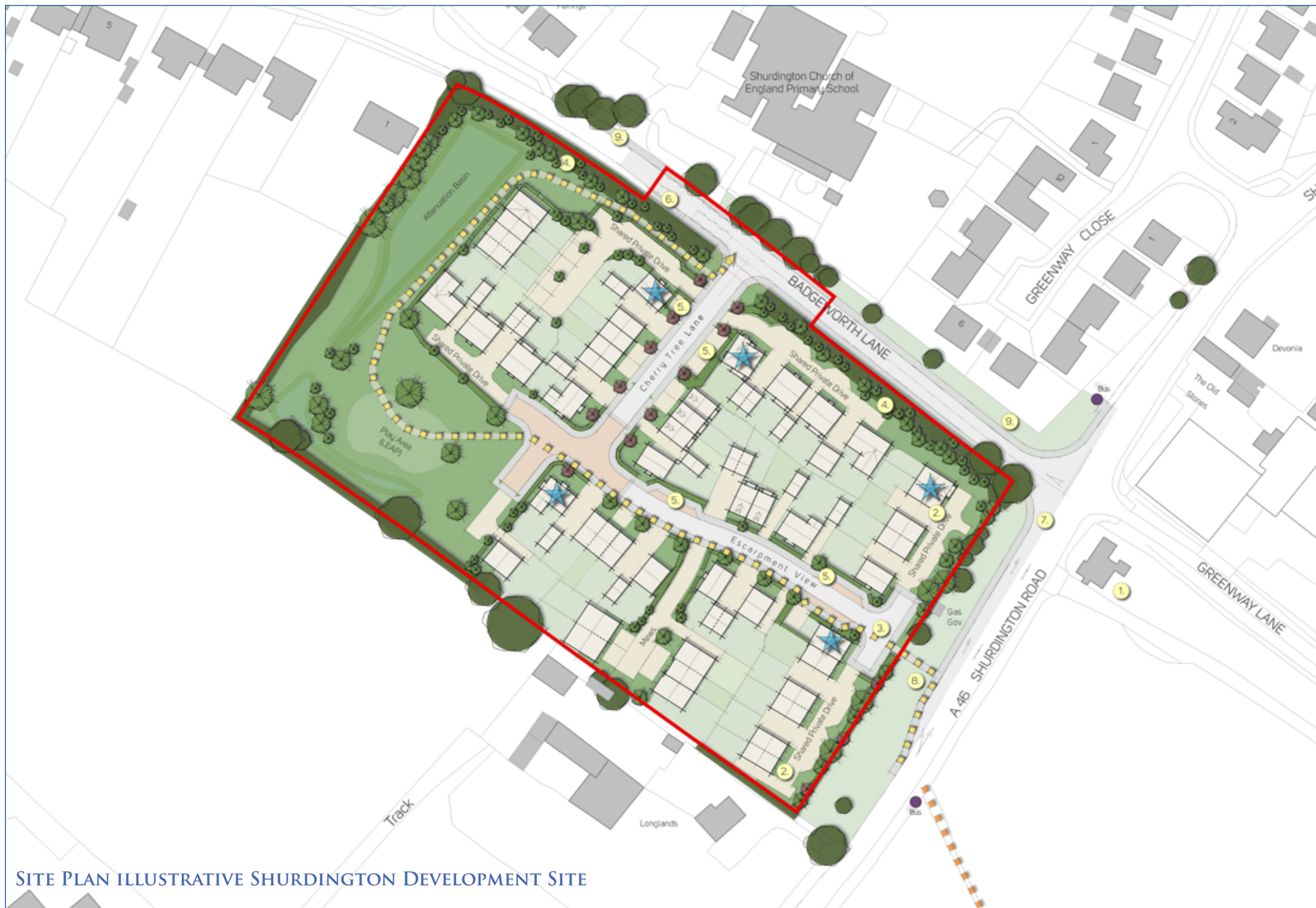
SITE PLAN ILLUSTRATIVE SHURDINGTON DEVELOPMENT SITE